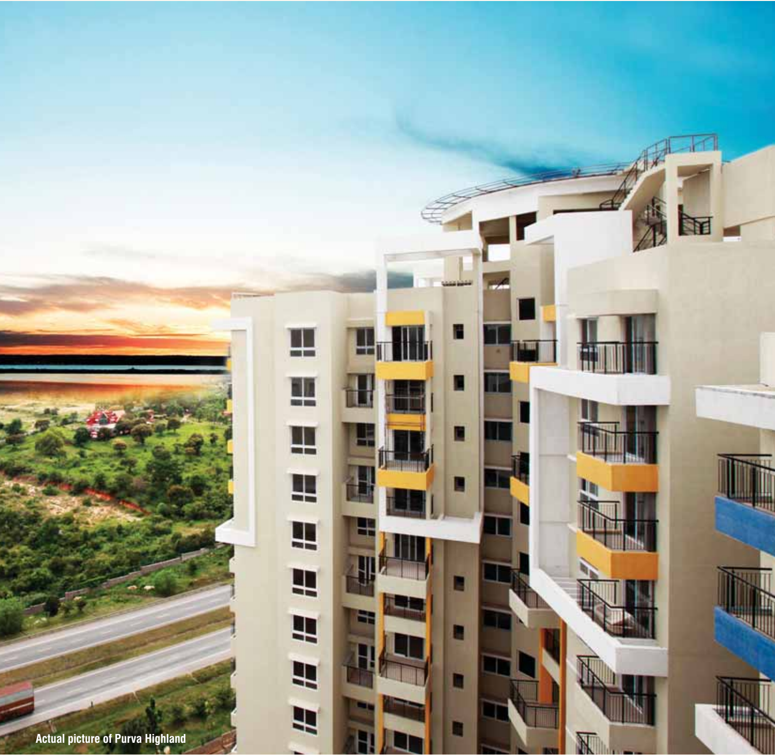
Actual picture of Purva Highland