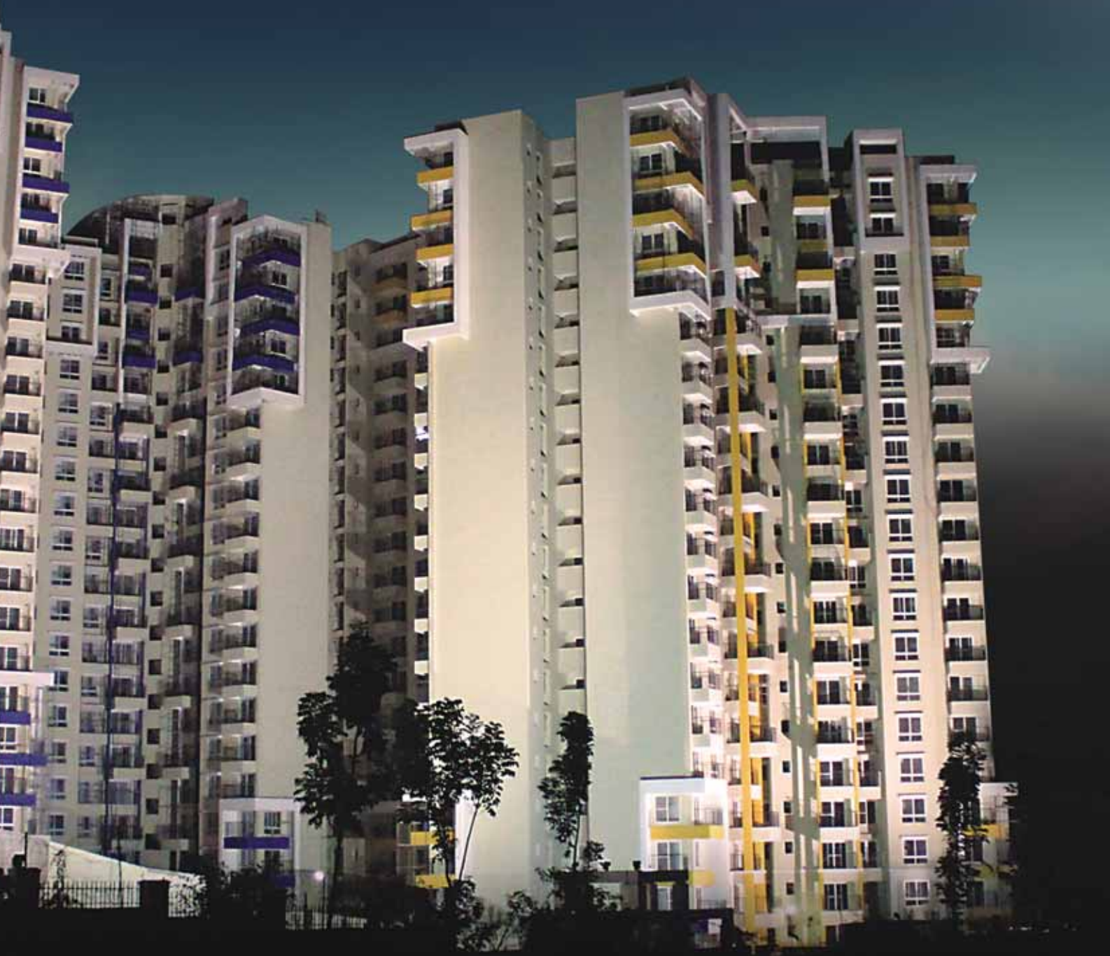
Actual picture of Purva Highland taken from the NICE Peripheral Road