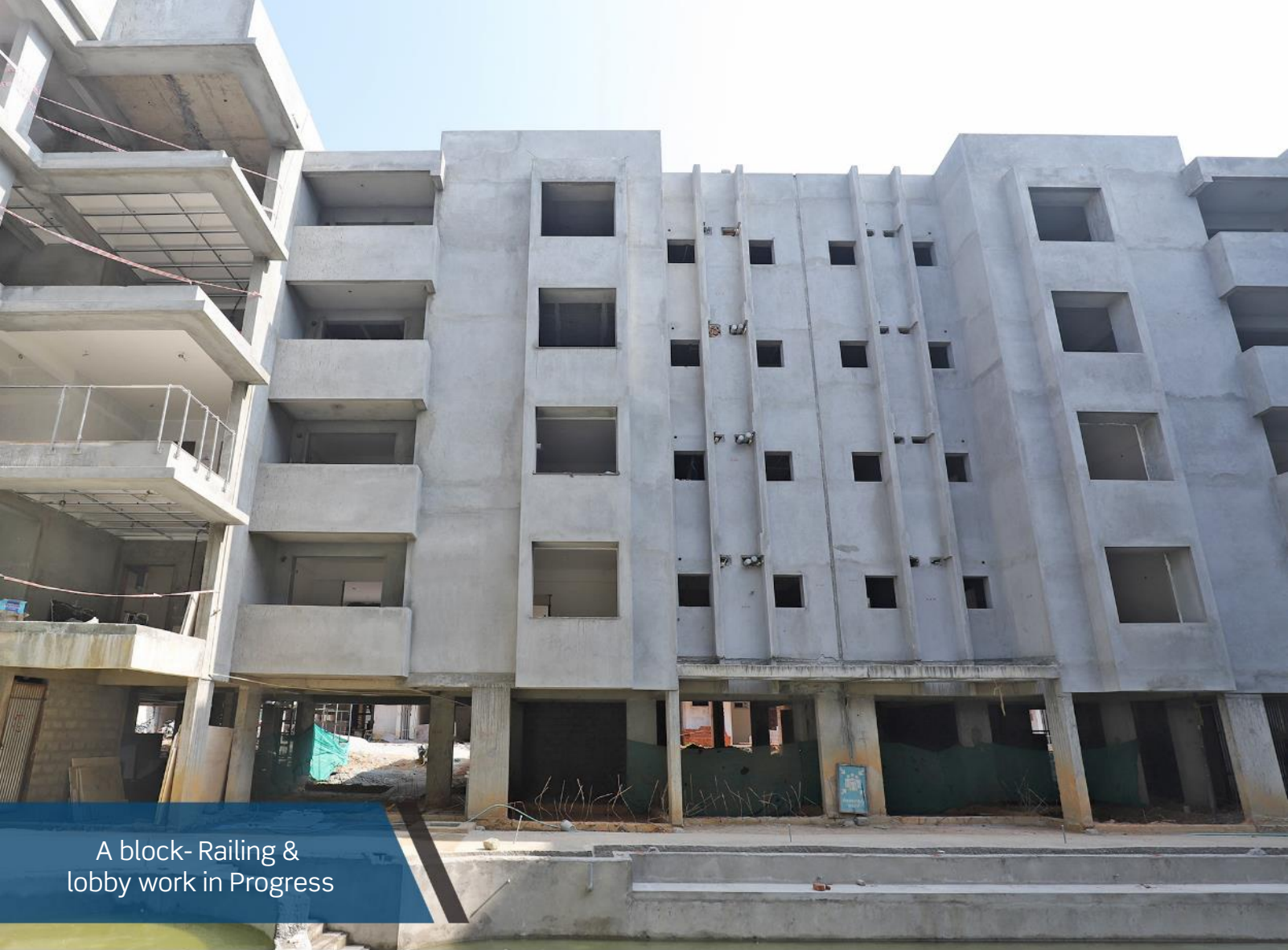
A block- Railing & lobby work in Progress