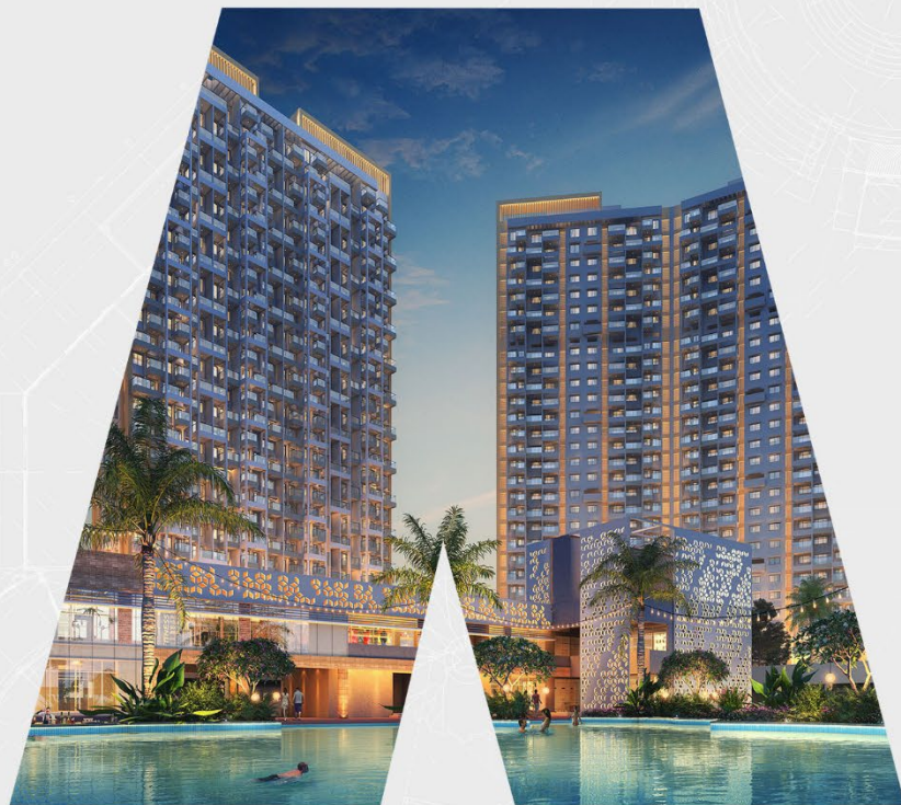
A PURAVANKARA HOME AT EMERALD BAY