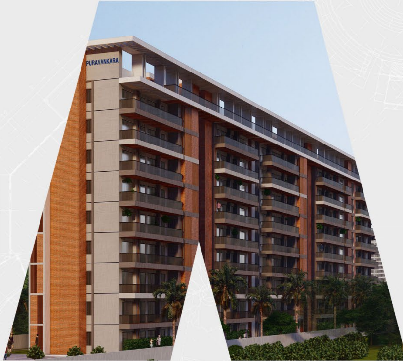
A PURAVANKARA HOME AT PURVA MERAKI