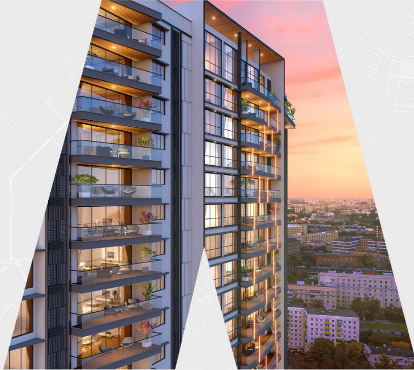
A PURAVANKARA HOME AT PURVA ORIENT GRAND