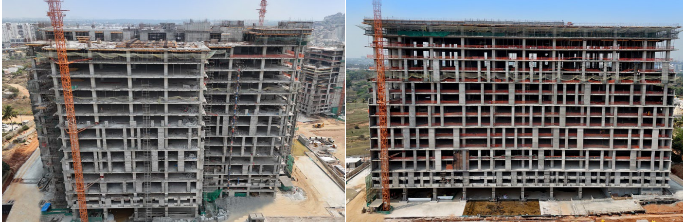
Actual site photograph