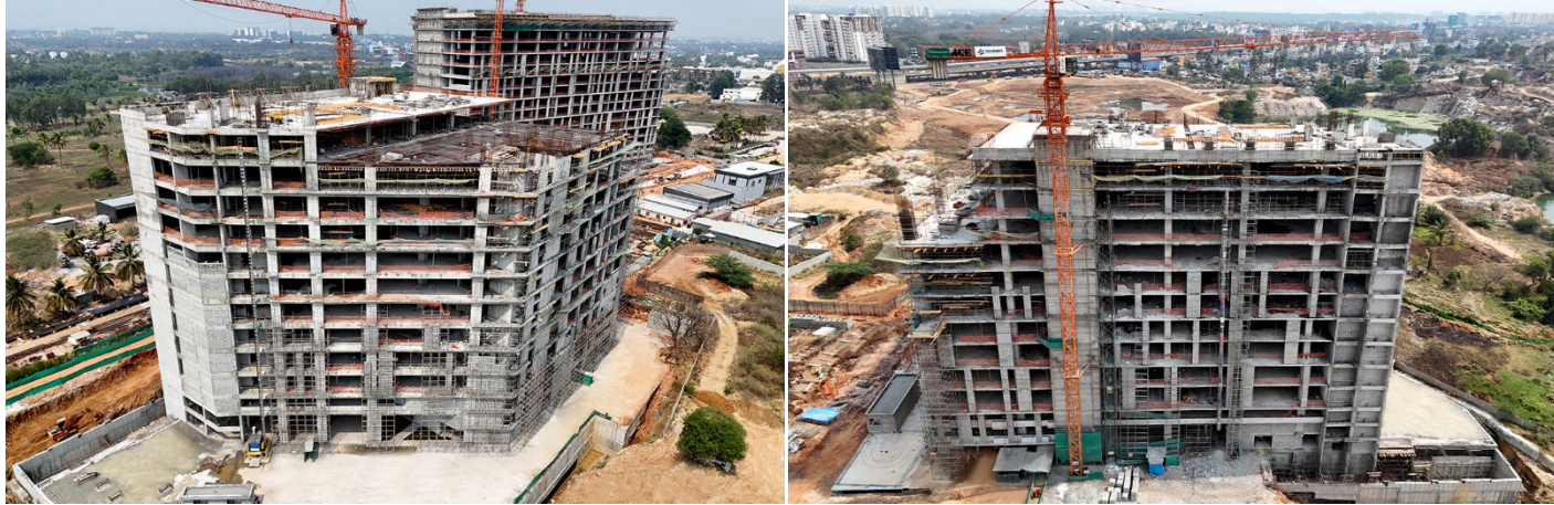
Actual site photograph