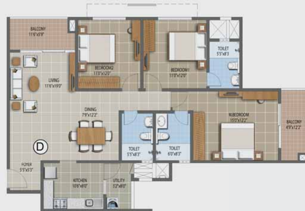
Type D - 3B + 3T (Grand)

Furniture fixtures or fittings shown in the floor plan are not standard and will not be provided in the apartment. Areas mentioned herein are approximate and shall vary based on selected apartment. Common areas/lobbies and window placement may vary based on selected floor. All plans are in accordance with the latest approved sanctioned plan and are subject to changes mandated by government authorities and /or applicable laws from time to time.