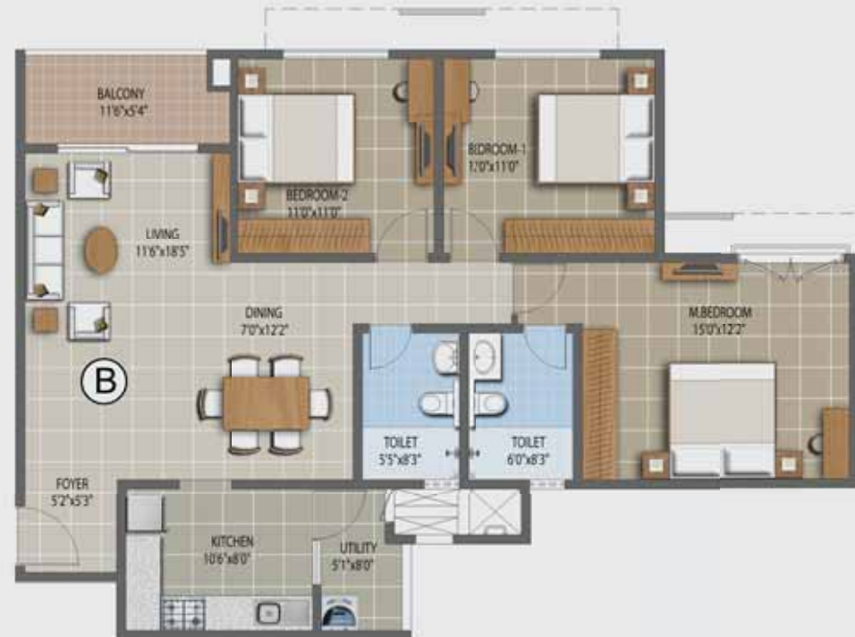
Type B - 3B + 2T (Comfort)

Furniture fixtures or fittings shown in the floor plan are not standard and will not be provided in the apartment. Areas mentioned herein are approximate and shall vary based on selected apartment. Common areas/lobbies and window placement may vary based on selected floor. All plans are in accordance with the latest approved sanctioned plan and are subject to changes mandated by government authorities and /or applicable laws from time to time.