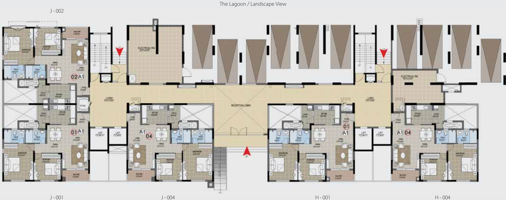
Wing - J