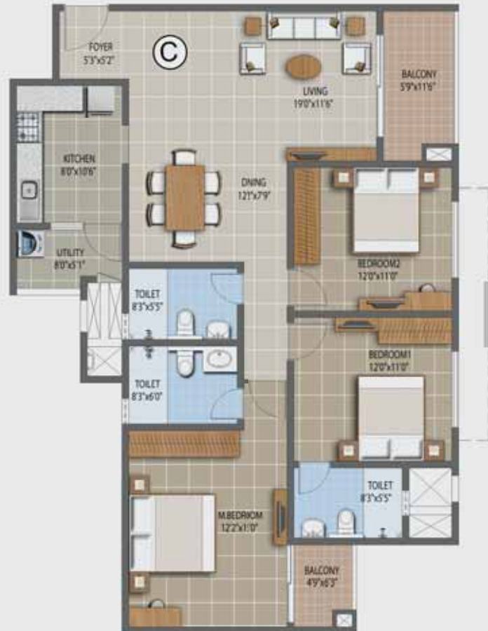
Type C - 3B + 3T (Grand)