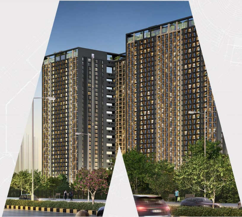
A PURAVANKARA HOME AT PURVA ATMOSPHERE