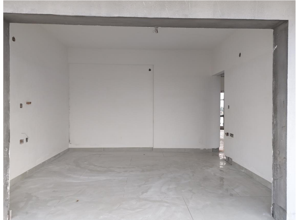
Tower A - Floor Tiling completed