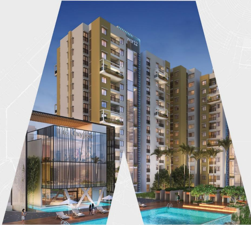
A PURAVANKARA HOME AT PURVA CELESTIAL