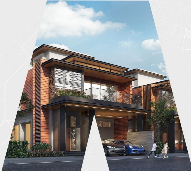
A PURAVANKARA HOME AT SPARKLING SPRINGS